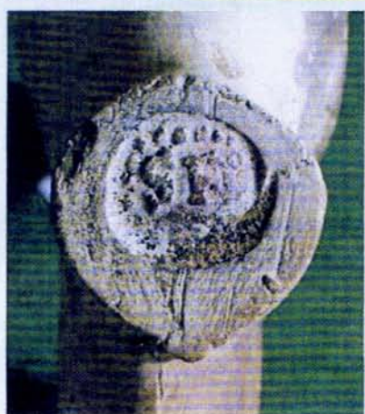
century maker's marks from Dublin and Drogheda. Left: Early bowl base with maker's initials. Below: Reproduction of highly decorated nineteenth-century pipe.